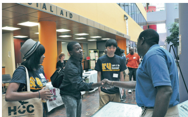
Current and potential students took advantage of the SOAR Learn and Earn Summit at HCC Southwest's Alief Campus.