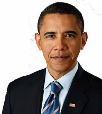
President Barak Obama