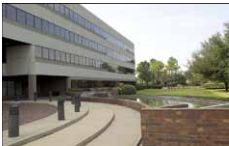
Southwest Alief Academic Center