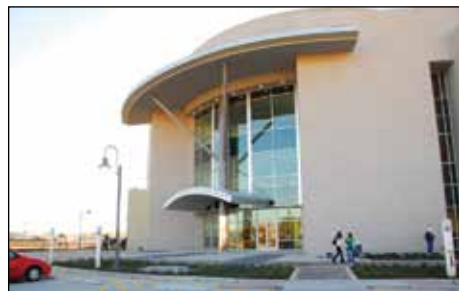
Southwest Stafford Learning Hub