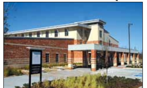
Southwest Missouri City Academic Center